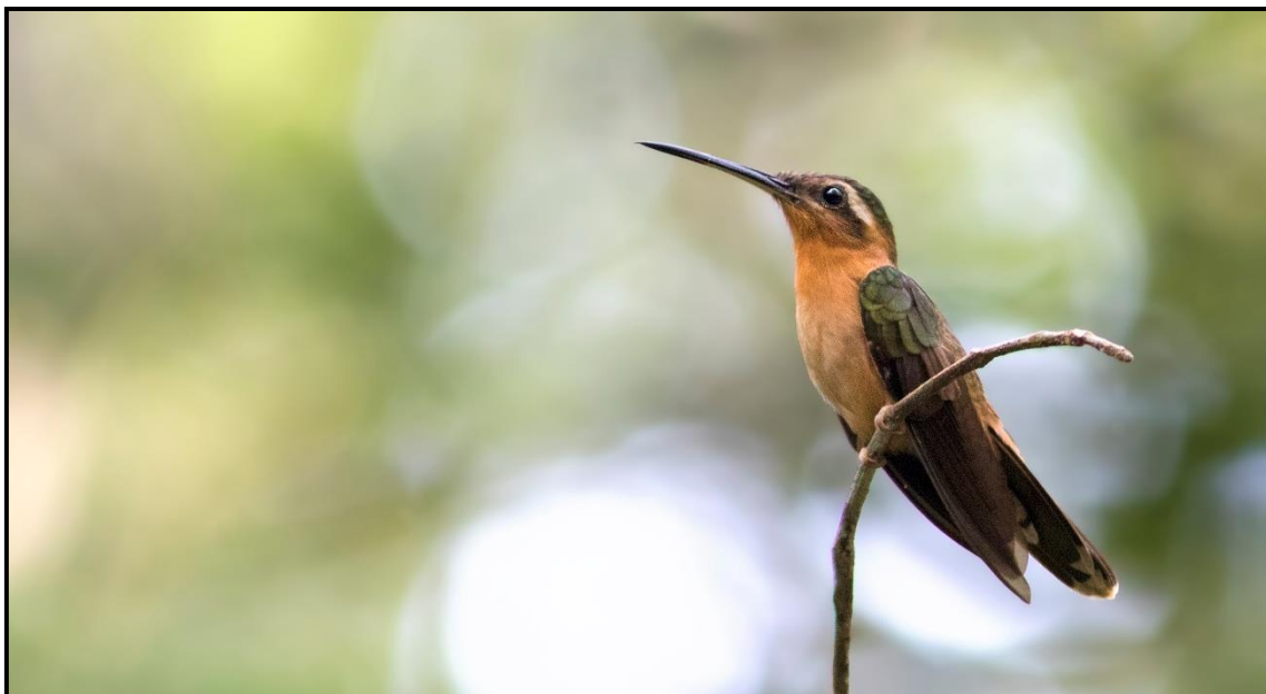
Day 14: AM Birding in Porto Seguro and departure.