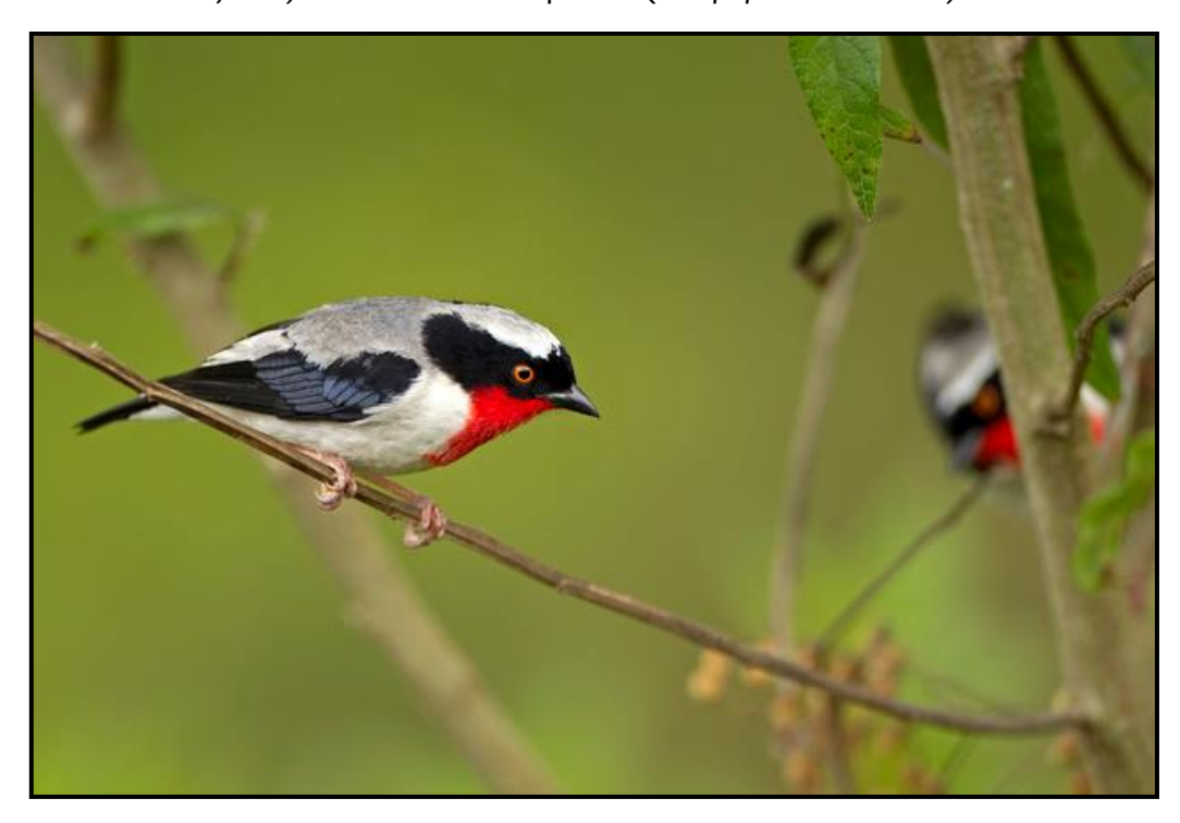
Day 4: Full Day Birding in VARGEM ALTA.

Summary: Among the highlights for this area are Shrike-like Cotinga (Laniisoma elegans), Spot-billed Toucanet (Selenidera maculirostris), Black Hawk-Eagle (Spizaetus tyrannus) and Rio de Janeiro Antbird (Cercomacra brasiliana). Second chances for the Long-trained Nightjar (Macropsalis forcipata), Frilled Coquette (Lophornis magnificus), Yellow-eared Woodpecker (Veniliornis maculifrons) and Robust Woodpecker (Campephilus robustus).