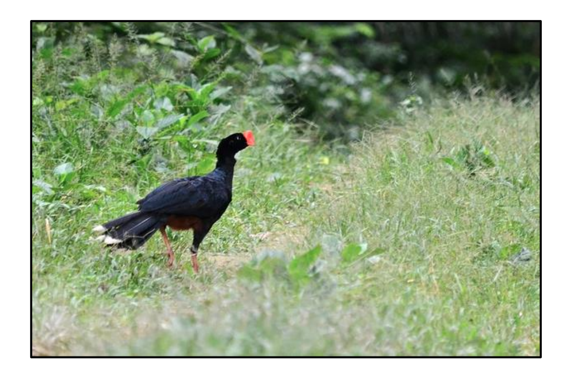
Day 2: Full Day Birding in Amazônia National Park.

Area description: There are several trails inside the National Park with different lengths, we will access at least 4 of them, where the canopy of more than 40 meters reigns, in these places there are small streams (Igarapés), where it is also possible to find species linked to this type of environment. In addition, the Transamazônica is a great place to observe birds that are feeding in the trees with fruits in the margins of the road.