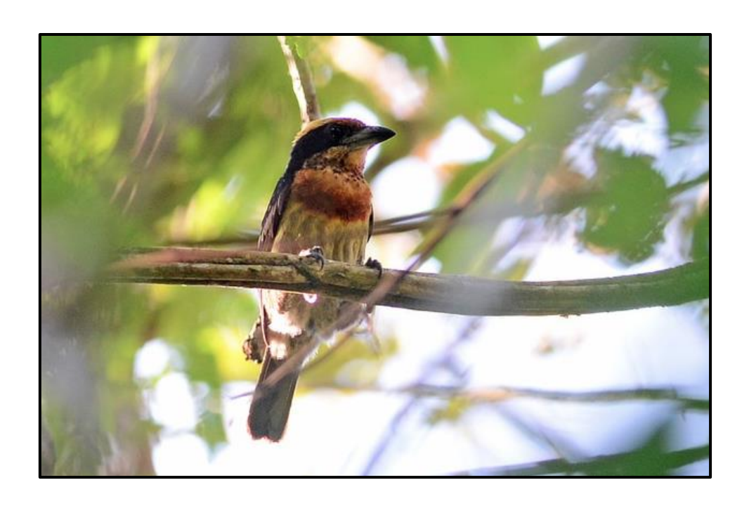
Day 3: Full Day Birding in Amazônia National Park.

AM birding along the famous Capelinha trail, where mixed flocks and ants swarm antbirds can be found, also Parrots. The targets species are: Broad-billed Motmot ( Electron platyrhynchum ), Harlequin Antbird ( Rhegmatorhina berlepschi ), Wing-banded Antbird ( Myrmornis torquata ), Pale-faced Bare-eye ( Phlegopsis borbae ), Black-spotted Bare-eye ( Phlegopsis nigromaculata ), Spix's Warbling-Antbird ( Hypocnemis striata ), Ihering's Antwren ( Myrmotherula inhering ), Snow-capped Manakin ( Lepidothrix nattereri ), Santarem Parakeet ( Pyrrhura amazonum ), Kawall's Parrot ( Amazona kawalli ).