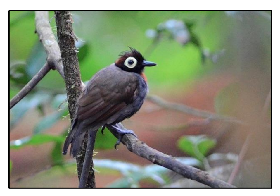
Day 4: Full Day Birding in Amazônia National Park.

AM birding at the Park's headquarters and on nearby trails. Among the species that we will look for are Natterer's Slaty-Antshrike (Thamnophilus stictocephalus) Flame-crowned Manakin (Heterocercus linteatus), Black-bellied Gnateater (Conopophaga melanogaster), Vulturine Parrot (Pyrilia vulturina), Dark-winged Trumpeter (Psophia viridis), Collared Puffbird (Bucco capensis).