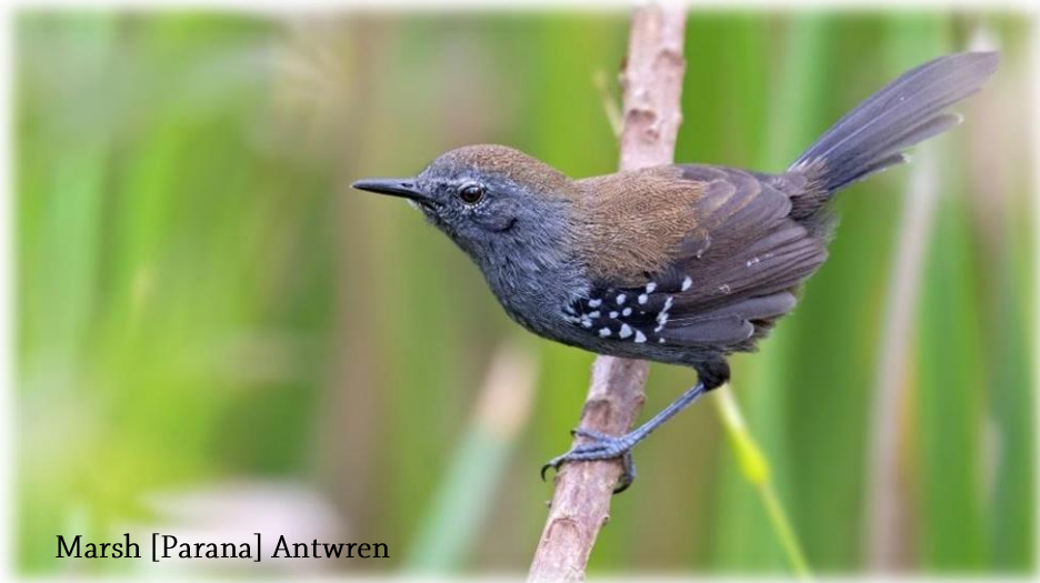
Marsh [Parana] Antwren