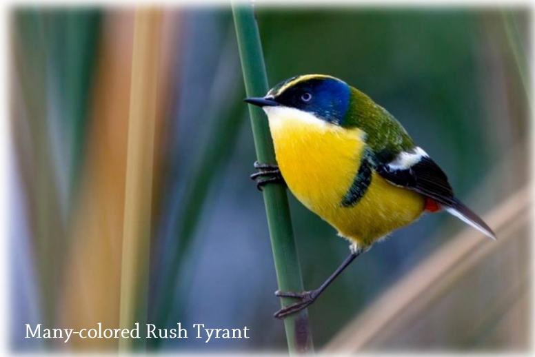
Many-colored Rush Tyrant